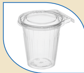
Tamper Evident Cup with Flat Hinged Lid