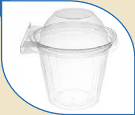
Tamper Evident Cup with Dome Hinged Lid