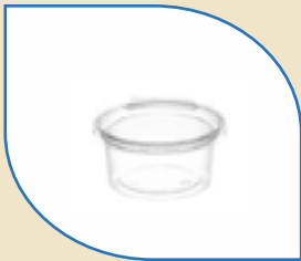
Round Hinged Container