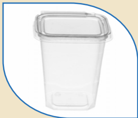
Tamper Evident Square Hinged Container