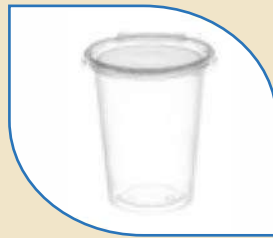
Round Hinged Container