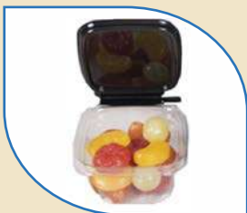
Tamper Evident Square Hinged Container