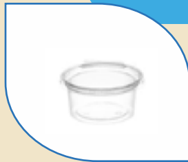
Round Hinged Container