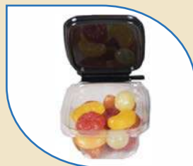
Tamper Evident Square Hinged Container