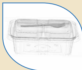
Tamper Evident Rectangular Hinged Dome Lid